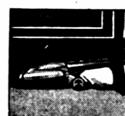
Gets under furniture easily. Housing unit only 5 inches high. Has headlight for easy seeing.