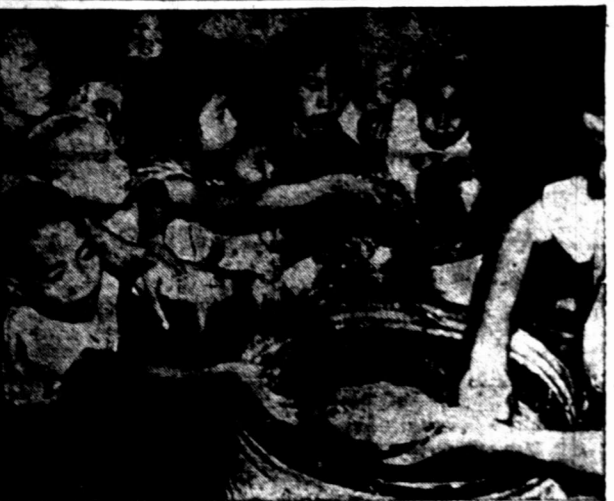
SOUP'S ON! —First sound of the dinner bell brings a rush of hungry Korean waifs at the Munske orphanage in Seoul. The youngsters are seen fighting for first place at the serving counter, where their bowls are filled with rice.