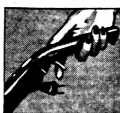
No foot-pedal acrobatics. Adjust handle to any position with trigger on handle.