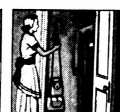
So easy to store. Cleaner hangs flat against wall. Does not take an inch of floor space.