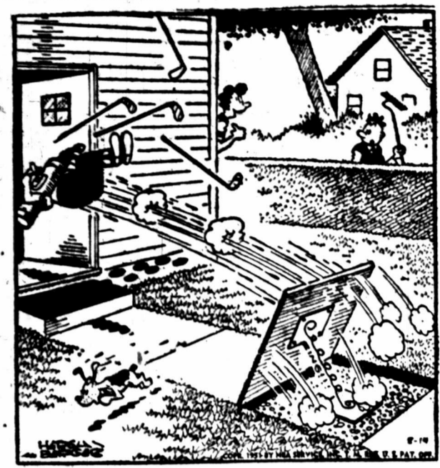
"It's a hidden springboard—when George sneaks out for golf instead of mowing the lawn, I just push a button!"