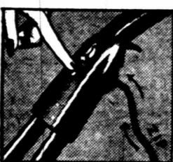
No winding of cord. Cord reels in and out of handle automatically. No tripping over cord.