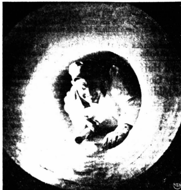
. . . and now through a cement pipe. It's tough on men and clothes.