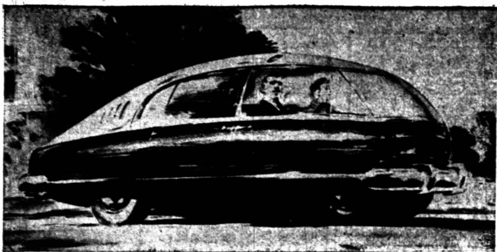
"TURBOCAR" IN YOUR FUTURE—This is what your "turbocar" of the future will look like, according to British jet expert G. Geoffrey Smith. The design promises greater visibility and more body space, thanks to the gas turbine power unit located over the rear axle.