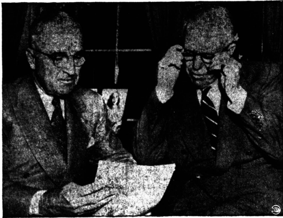
REPORTS TO BOSS—Secretary of Defense George C. Marshall reports to President Truman on his flying trip to Japan and Korea immediately after his arrival in Washington.