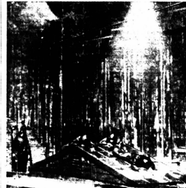
Over a slate rooftop through a downpour of controlled "rain" . . .