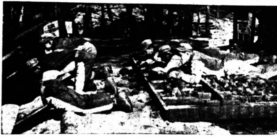
In green fatigues with white fronts, GI's crawl over cinder-packed rail ties, then down cobblestones.

It shouldn't happen to the K-9 corps, the things they do to GI clothing and equipment at the Army Quartermaster Board's testing center at Fort Lee, Va. There, to test durability of uniforms, groups of rugged soldiers crawl through barbed wire, cement pipes, gullies, thick brush and artificial rain to speed up the wear and tear of experimental Army gear. Here are some excerpts from a day in the short life of a GI fatigue suit at the testing center.