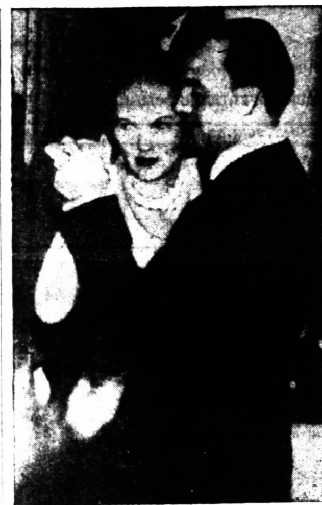
ALY KAHN GETS MAD—Prince Aly Kahn, dancing with the glamorous Joan Fontaine at the most fashionable party of the year in the famous Laurent Restaurant in Paris, France, flew into a rage with photographers when he found them taking his picture through a window. He insisted "this is serious business" and threatened to "bump their heads together."

Ordinary meteors move around in random directions, unlike the great celestial bodies which have fixed courses.