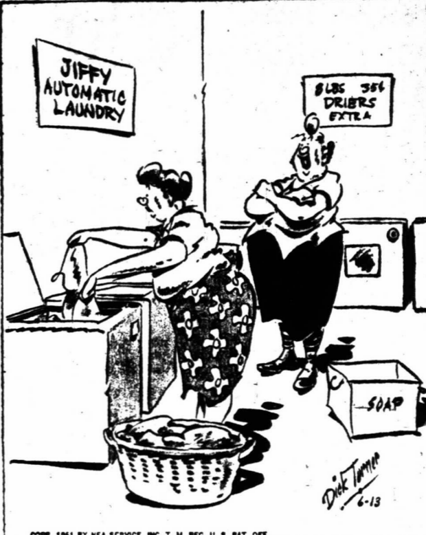
"You really get 35 cents' worth here—the dirt that comes out of the clothes and the dirt you get waiting for the clothes to come out!"