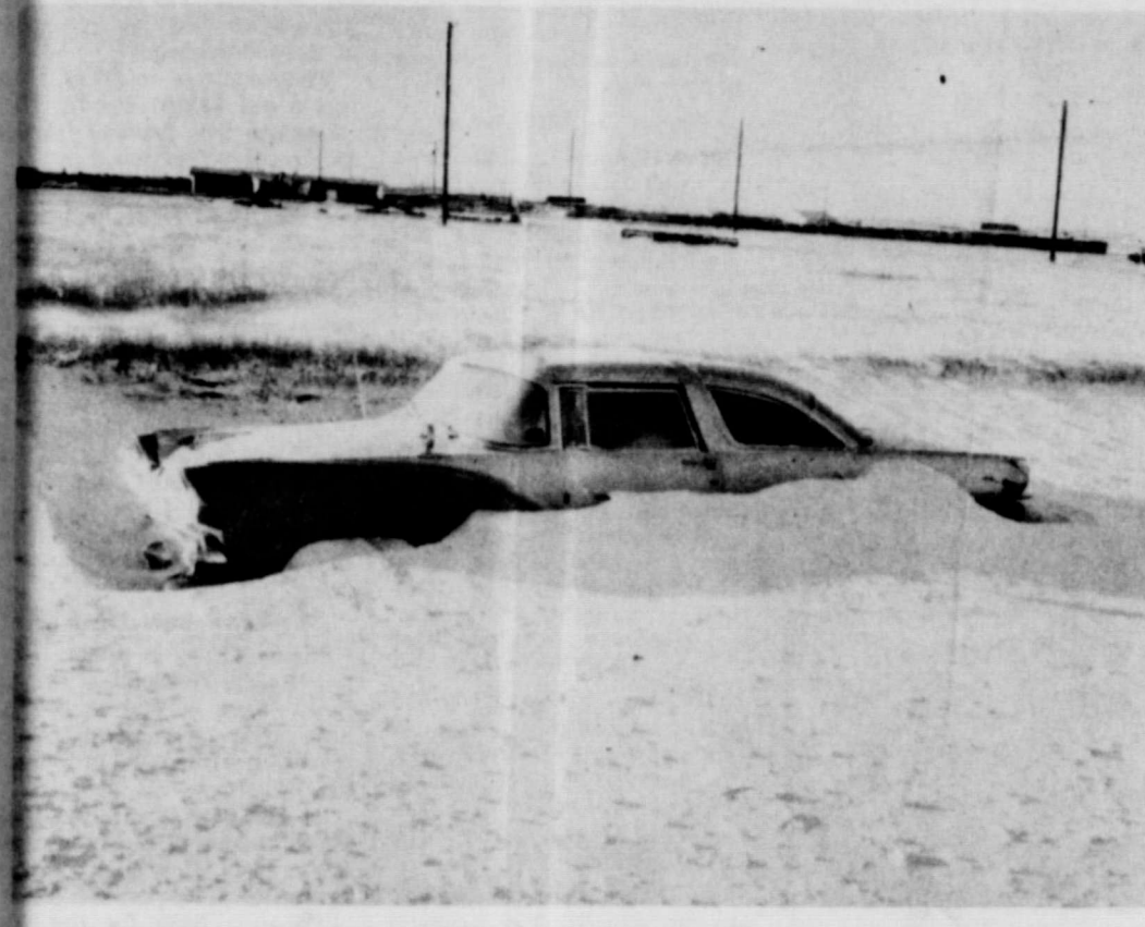
No reports of stalled motorists were received by the Sheriff's department during the weekend blizzard. Passengers from this ear, I mile west on the Gruver highway, evidently caught a ride to town with someone.