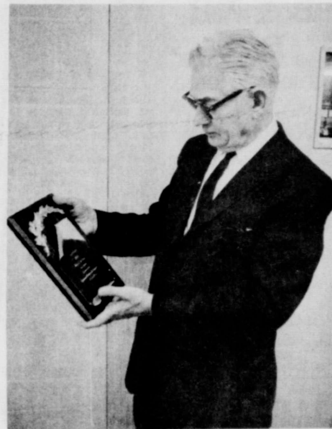
MAN OF THE YEAR