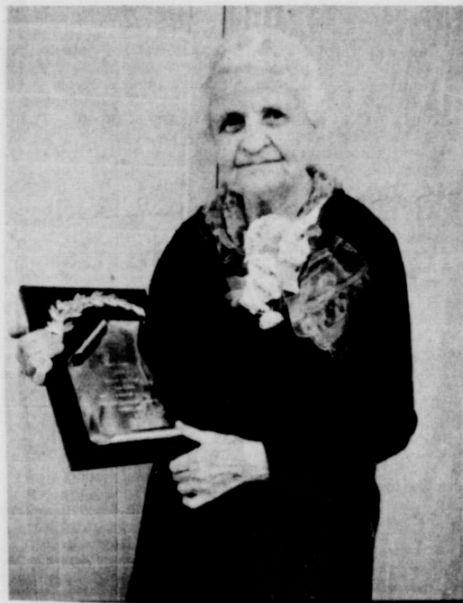
WOMAN OF THE YEAR