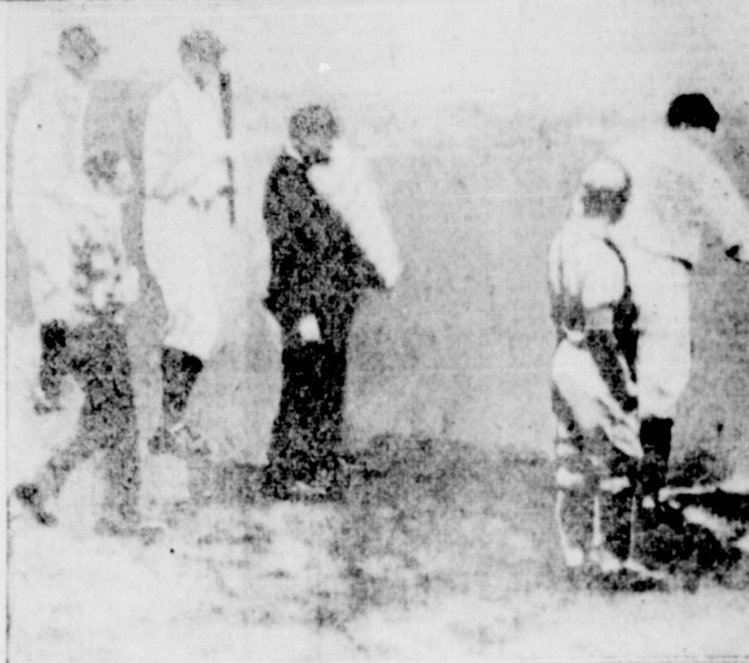
Babe Ruth walked in the first inning of the World Series game Friday and scored on Lou Gehrig's home run. Shows Ruth congratulating Gehrig on driving him in. The Yankees won the game, 9 to 2.