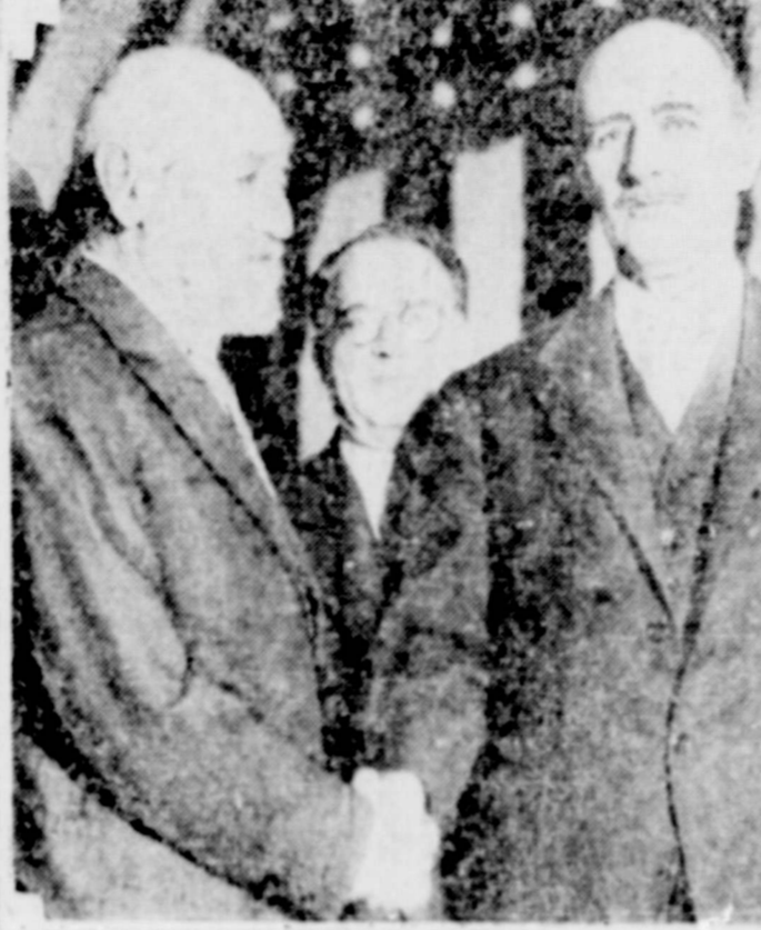
That was tribute to Nathan Straus, venerable merchant prince and philanthropist, at reception by Zionist organizations of America for Field Marshal Lord Allenby, who captured Palestine from the Turks and made it possible to re-establish the Jewish homeland.