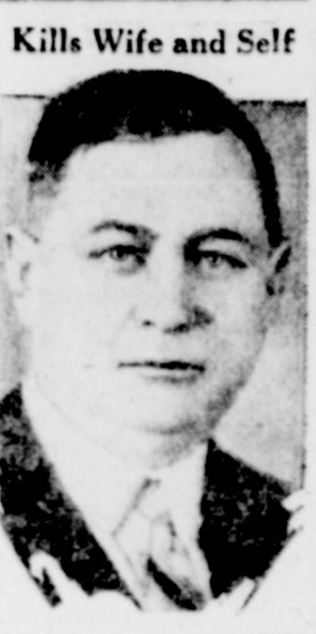
Kills Wife and Self

WICHITA, Kans., Oct. 8.—The gasoline consumption of airplanes is only a "drop in the bucket" to the petroleum industry, a recently completed survey of the connection of aviation to the petroleum industry by Clavel B. Maps, technologist of the Mid-Continent Oil and Gas association, shows.