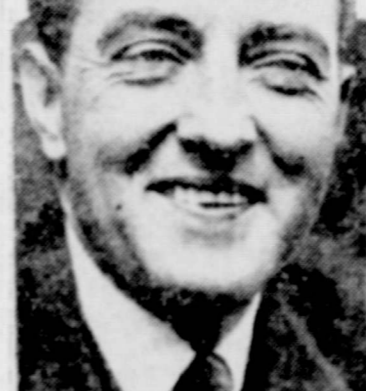
Here's a close-up of Commander Richard E. Byrd, taken in front of his Back Bay home in Boston when he arrived in the 'Hub' city to bid farewell to his family. He leaves immediately for the Antarctic.