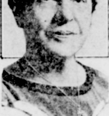
Miss Lillian D. Wald, nationally known social worker, has announced that she will support Gov. Smith for the Presidency on his great record of humanitarian legislation.