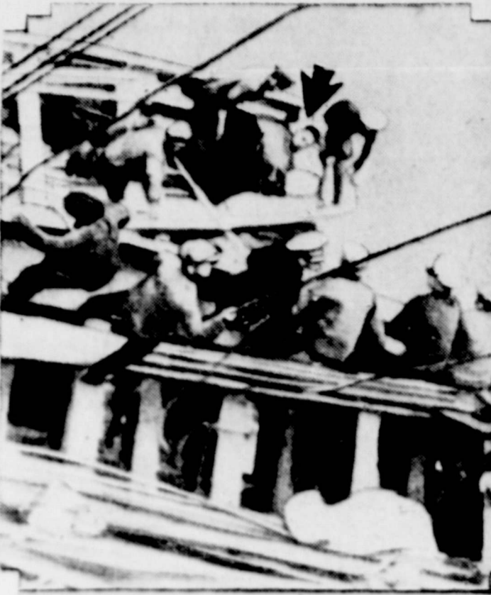
Stricken stoker of Italian tanker Perseo is here shown being transferred to boat put out by S. S. Transylvania upon radio call from freighter's master. The engine room worker was placed in sick ward of liner and treated by ship's doctor. The picture above was snapped by passenger aboard the Transylvania.