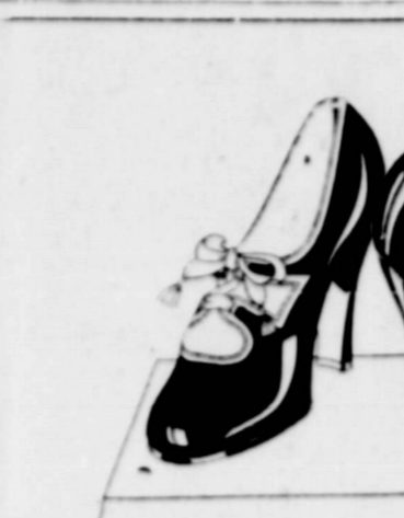
A STYLE, STUDIO, CREATION

Most of Harpersville went to Breckenridge Saturday to get the election returns. This community and the Pleas- ant Hill community have decided to meet on about midway and build an old fashioned arbor and have a union meeting for the two places and all who wish to attend. They located the arbor near the Bene filling station, where old Pleasant Hill was years ago. Every- body is invited to come.