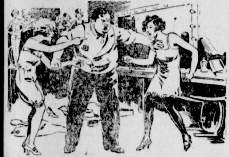
He silenced them, as each tried to interrupt with her side of the story.

"Well, why didn't you give me a name?" she demanded.