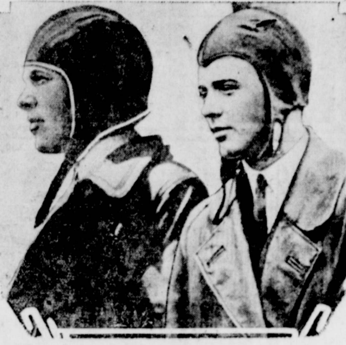
Miss Amelia Earhart, Boston social worker, and Colonel Charles A. Lindbergh, the world's best known aviator, look enough alike in their flying helmets to double for each other. Even to the close-cropped, yellow hair which fits her head like a bronze cap, does Miss Earhart resemble Lindy, and she possesses his infectious smile and dislike of publicity. For your information, hers is the picture on the left; on the right is Colonel Lindbergh.