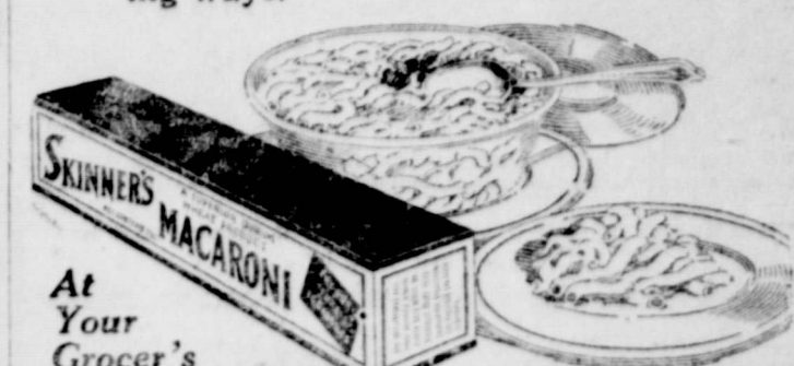
At Your Grocer's

Popular? Yes! Easily prepared to answer the call of insistent appetites . . . so tender . . . such wholesome goodness. May be served a hundred different, pleasing ways.