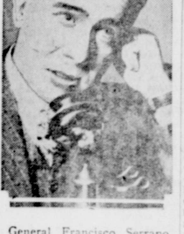
General Francisco Serrano, leader of revolt over Mexican presidential elections, was ordered shot and killed with 13 of his lieutenants.