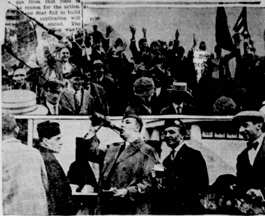
Despite minor anti-American disturbances in France, the American Legion, thousands strong, is doing what the Germans failed to: occupying France. Top picture shows the arrival of the first contingent of conventionaires at Cherbourg. Bottom picture was taken a few minutes later.