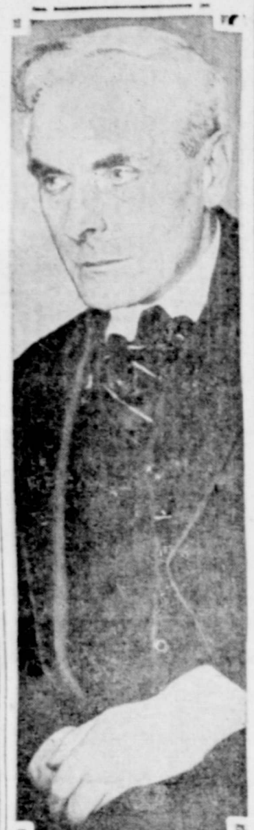
Thomas Johnson (above), labor leader, is expected to succeed President Cosgrave of Ireland, who is being forced out by Eamon de Valera adherents.