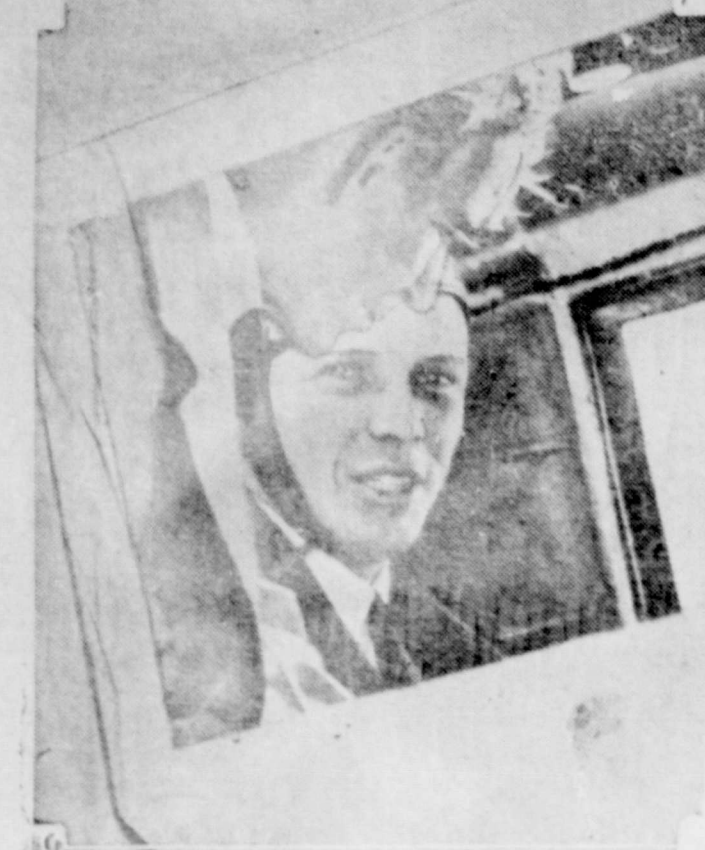
Henry Ford has taken his first airplane ride. Picture shows him in the cabin of the Spirit of St. Louis as Colonel Charles A. Lindbergh explained the controls of the ship before a flight over Detroit.

A bald-headed man in Kansas hair than the other, which he substitutes about every ten days to make it appear he has just been to the barber.