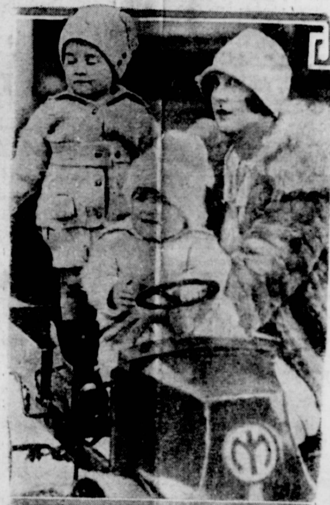
Rights to their two children are one of the principal issues between Charles Chaplin and his wife, Lita Grey Chaplin. Their disagreement is soon to be aired in California courts. Lita Grey has custody of the youngsters at present.