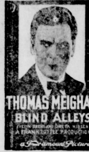
THOMAS MEIGHAN BLIND ALLEYS A FRANKLIELE PRODUCTION

"BLIND ALLEYS" will open your eyes to an entirely new and different Tom Meighan.