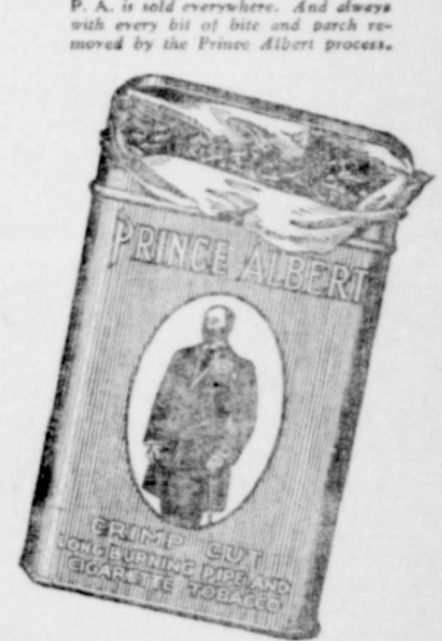
P. A. is sold everywhere. And always with every bit of bite and punch reserved by the Prince Albert process.

Do you ever smoke a pipe? I'd like to bet that you will—often—when you find out how good it tastes with P.A. for packing. Here's double-barreled smoke-joy. Pipe or cigarette, you can't beat good old P.A. Beat it? Why you can't even catch up with it! Try P.A.