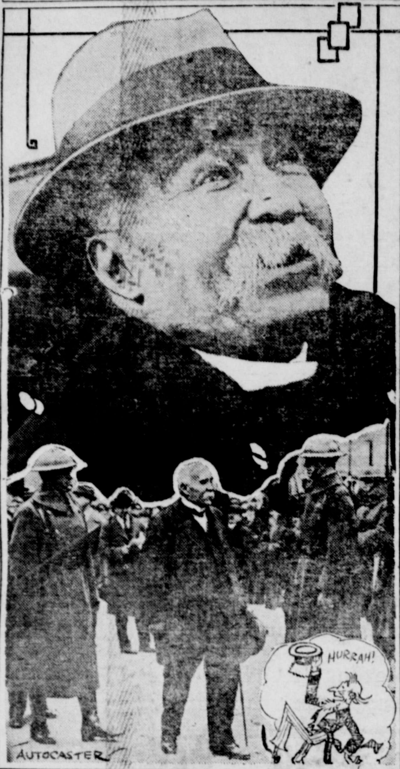
Georges Clemenceau, The Tiger of France and the great War Premier, is now on a triumphant tour of the United States, carrying a message of national friendship. The grizzled old warrior is now 81 years old. Above—his first look up at the famous Woolworth Tower in New York. Below—his reception at City Hall Park, N. Y.