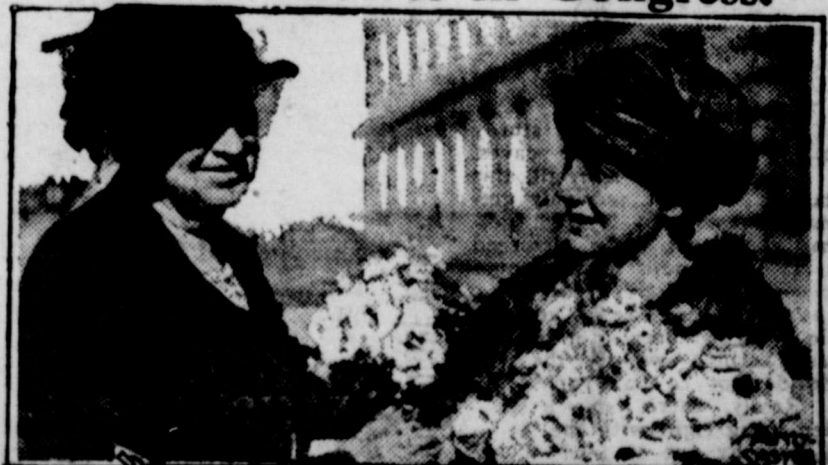
Mrs. Winifred M. Huck, of Illinois, mother of three, is the first mother elected to Congress. As shown here on the right, she is receiving flowers from Congresswoman Alice Robertson of Oklahoma, who failed for re-election to the House.