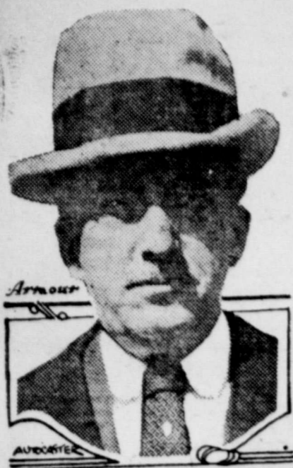
J. Ogden Armour is shown here as he left the Department of Agriculture in Washington after conferring with Government officials regarding a big merge of Meat Packing Houses. The Farm Bloc will oppose it.