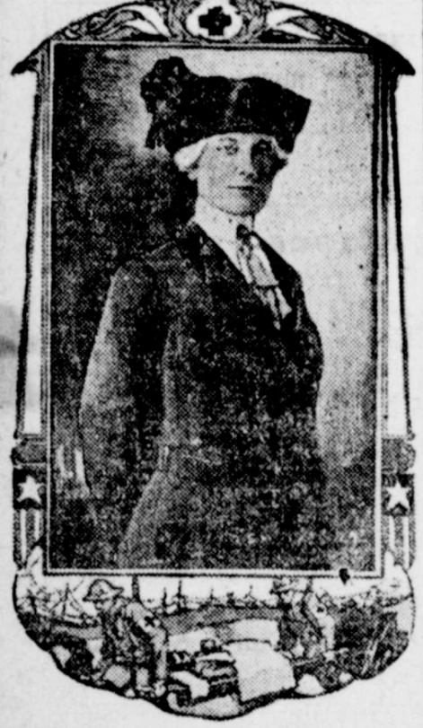
ELEANOR ROBSON BELMONT. the devastated districts, for the children or for the aged, it is always on the same plan of backing up the lish a center and operate in a given French if they have any organization section around the center.

The main work of the American Red Cross, however, is, of course, carried on in France. The policy of those heading this work is to back up the French in their own efforts and to help them develop along their own lines, not to root out French institutions and transplant American ones. Whether we work, then, in canteens, in warehouses, in dispensaries, for pollus or for refugees, in Paris or in