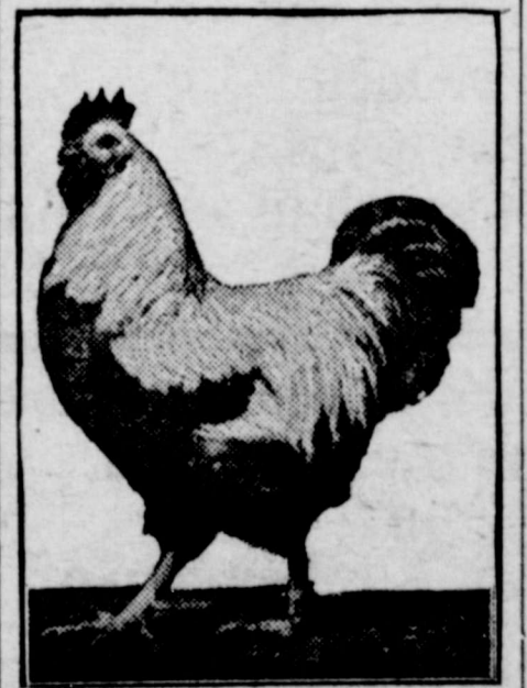
Silver Penciled Plymouth Rock Cock.

When you are selecting the male birds from the young cockerels of your own flock you should use your best judgement and find the best individuals. In this case you must be in-