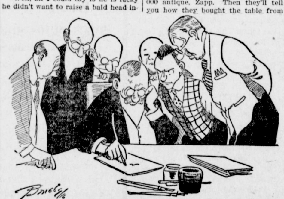
Signs His Name in the Presence of the Managing Editor, the Art Editor, Two Prominent Clergymen and a Handwriting Expert."

"And quite right too," Birsky said. It's always a joke to stick a bargain hunter, Zapp, because if he wasn't out to stick somebody himself a bargain hunter wouldn't be a bargain hunter. Why should a manufacturer suppose it There is fellers in this town, Zapp,millionaires and college gradgewates -which when they talk about quack stores gets so red in the face that you'd think they was discussing labor unions, Zapp, and in the very next breath, y'understand, they'll tell how they was motoring in the mountains of West Virginia and how they come across a log cabin where an old feller and his wife was raising a little corn for a living and eating it off a brokendown mahogany table mit bandy legs, club feet and all the other deformities which turns a human being into a helpless cripple and a table into a $1,-000 antique, Zapp. Then they'll tell