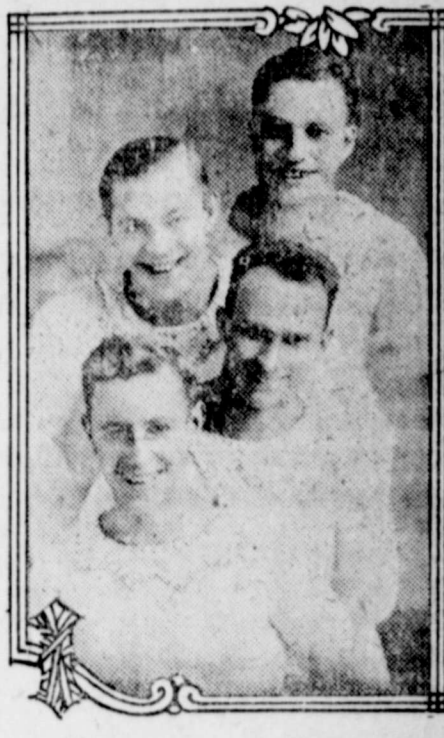
THE FOUR CASTERS.

The Four Casters are undoubtedly the best aerial acrobats performing before the public today. They have been featured in practically every part of the world and will come to Dallas with the reputation of having excelled