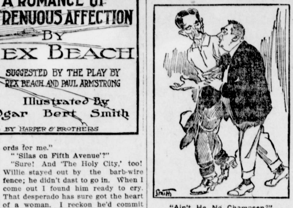
"Ain't He No Champeen?"

"Sure! Don't you?" Fresno explained his doubts by a