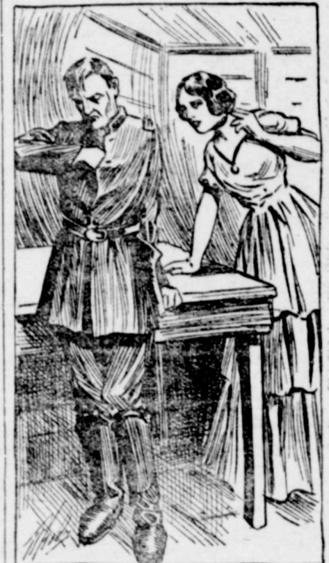
I Ran My Hand Within, Touching the Flesh.

"It is not likely he did," she answered thoughtfully. "It may have been mere accident which put the document in his hands. See, here is a