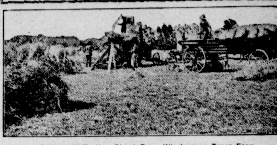
Baling Alfalfa Hay Direct From Windrow on Texas Farm.

(Prepared by the United States Department of Agriculture.)