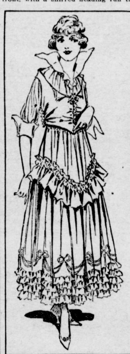
Youthfulness Is Expressed Here in a Pretty Disposition of Net and Azure

The bodice is rounded out quite expansively in front, but the curve across the back is shallow, with the upper edge flared on the shoulder seams to stand away from the figure as illustrated. It hooks directly in front, with a shirred heading run the