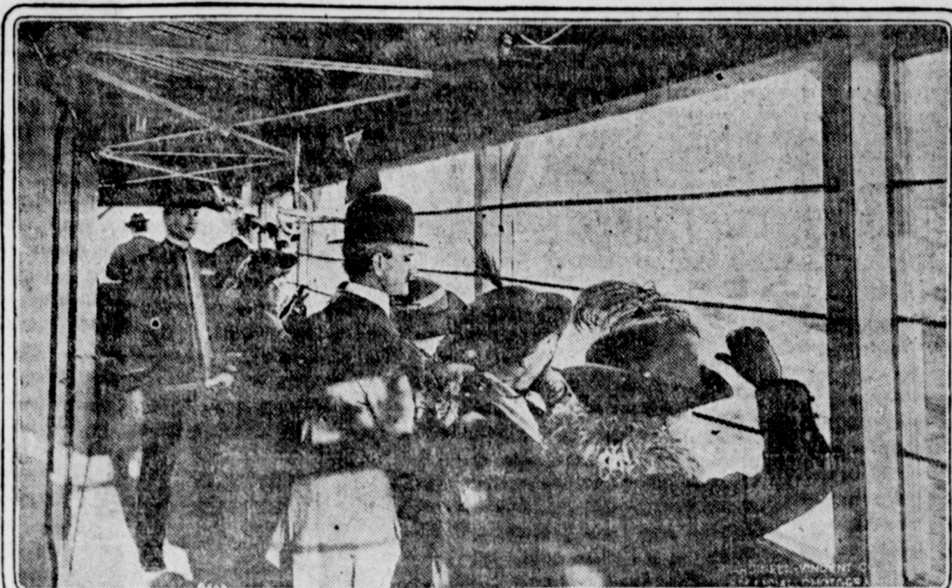
VISITORS ON THE AEROSCOPE 265 FEET ABOVE THE EARTH