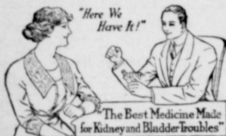
The Best Medicine Made for Kidney and Bladder Troubles

Crockett, : : : Texas Office Upstairs over Monzingo Millinery Store