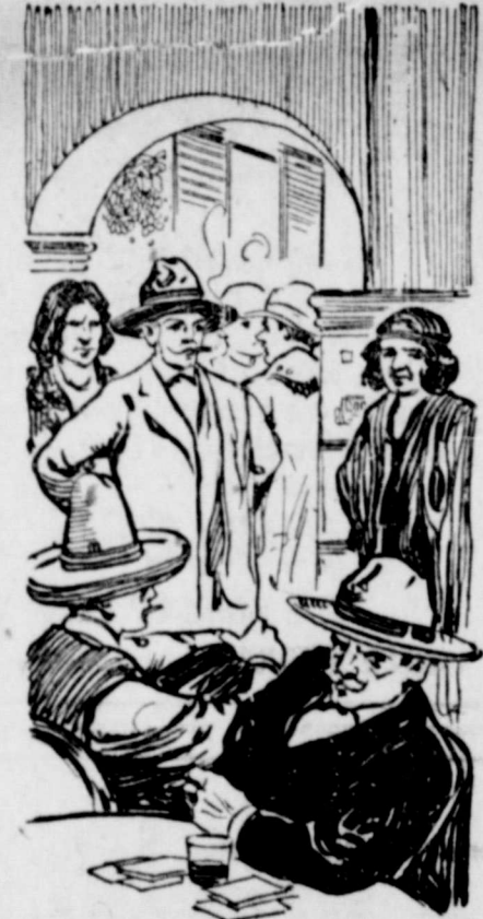
It Was a Merry Company, Indeed.

But as his gaze swept the length of the vine-covered corredor it halted for a moment and a slow smile came over his face. In the green depths of a passion-flower vine he had detected a quick, birdlike motion; and then suddenly, like a transformation scene, he beheld a merry face, framed and