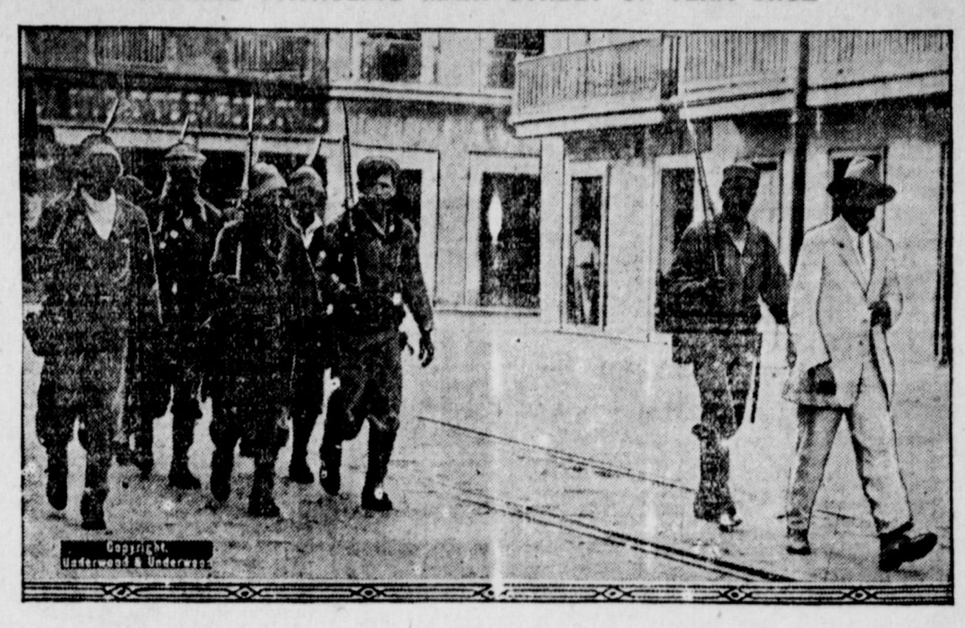
A corporal's guard of American bluejackets patroling the Avenue de Independencia, the main street of Vera Cruz. They are taking a Mexican prisoner to the guardhouse established near the railway yards.