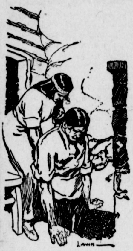
"Now Push Yourself Down, Monsieur! I Say You Must!"

lademoiselle's word of warning comng back to mind-they were burning the cabin, and through some orifice the smoke was being swept down into this underground passage. If there were no outlet, no way by which it must die there in that black hole, ed my head, and sought to gaze about, choked and suffocated. I might lie there forever beside this hideous negro; lie there until our bones rotted, and we also became earth. The horror of the thought brought me to my