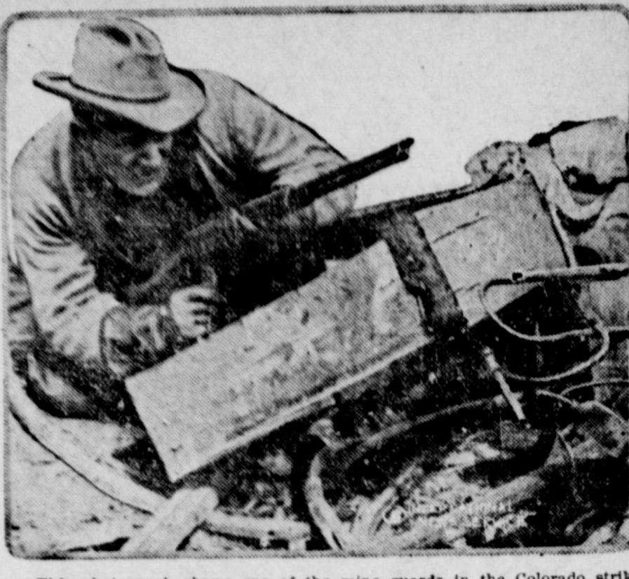
This photograph shows one of the mine guards in the Colorado strike zone firing at the strikers from behind the debris of a burned mine camp. Many of these guards were killed in the battles.

I got upon hands and knees again, slowly and with utmost caution, aware that if I was to escape notice I must advance as stealthily as a wild cat, the slightest sound would carry far in that gallery. I moved forward a yard, two, three yards, extending one hand out into the dark and feeling about carefully, before venturing another inch. Mine were the movements of a snail.