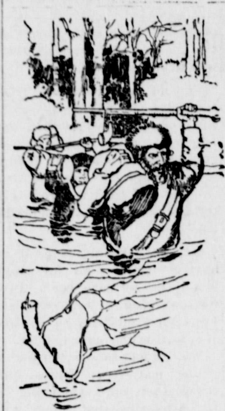
He Led the Way and We Followed In Single File.

"He reckons bout fifty miles, though it would be less than that straight across country. It takes maybe two days an' a night ter make the forks with good paddling."