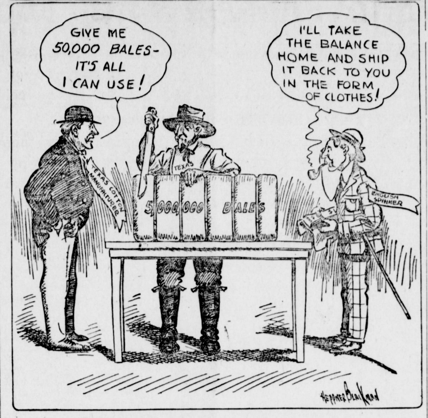
First in production, first in consumption and last in manufacture.

wandering from farm to farm. We now have 219,575 farms in this State operated by tenants which is fiftythree per cent of the total and the tenant farmers have made a net gain over the farm owners of thirty per cent during the past decade. At the present rate of gain in tenant farming, the home owner will entirely disappear in thirty-four years. Our homes are the cornerstone of government and legislation that con-