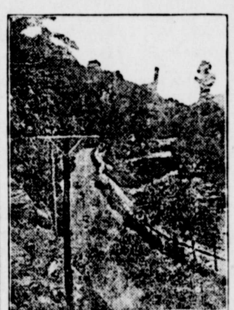
Good Road Along Tioga River.

"The Grange stands for and advocates federal aid for road improvement. There can be no good reason given why the government should not appropriate money for the maintaining and the improving of the public highway, the same as for our public