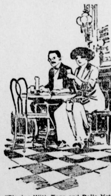
"Playing With Tops and Dolls Yet."

"You'll never get gray!" comforted the young man. "Not if you live to be 100. But I should think people like those over there would envy young