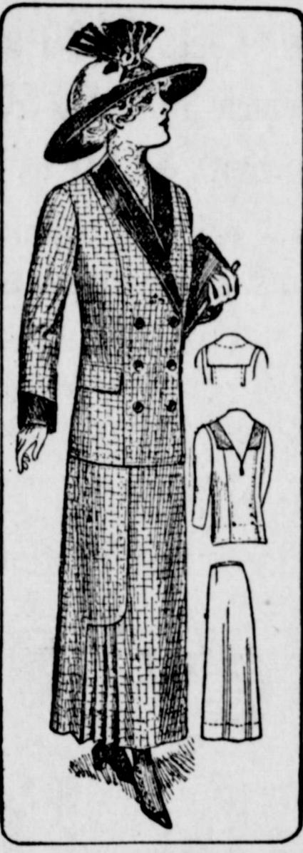
by many misses and small women.

Many a mother waits until this month before buying her young daughter's new suit, feeling perhaps that the old one is good enough to wear until then, or, maybe, wanting to be sure of the styles. This delay, while impossible for the boarding school miss, often allows much more choice in models and materials, and, since the majority buy early, the late comer is generally rewarded with some delightful bargains. The readymade frocks which have lost their first freshness with trying on are then reduced, and there are numerous short lengths of material which it seems to the shopmen advisable to add to the bargain displays, even though the season for wearing these textures is scarcely begun. The dresses are easily revived with a little