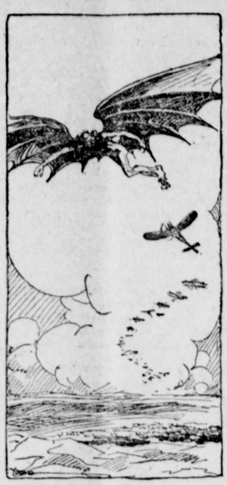
Whither He Was Leading Them, None but Himself Could Guess.

like a strong hand as a swerve to right or left took them a moment from Far below, so far that the trees looked like the toy trees upon the blocks fully at his mustache. which children play with, the people like toy men two inches tall, the beasts of the field like the beasts of