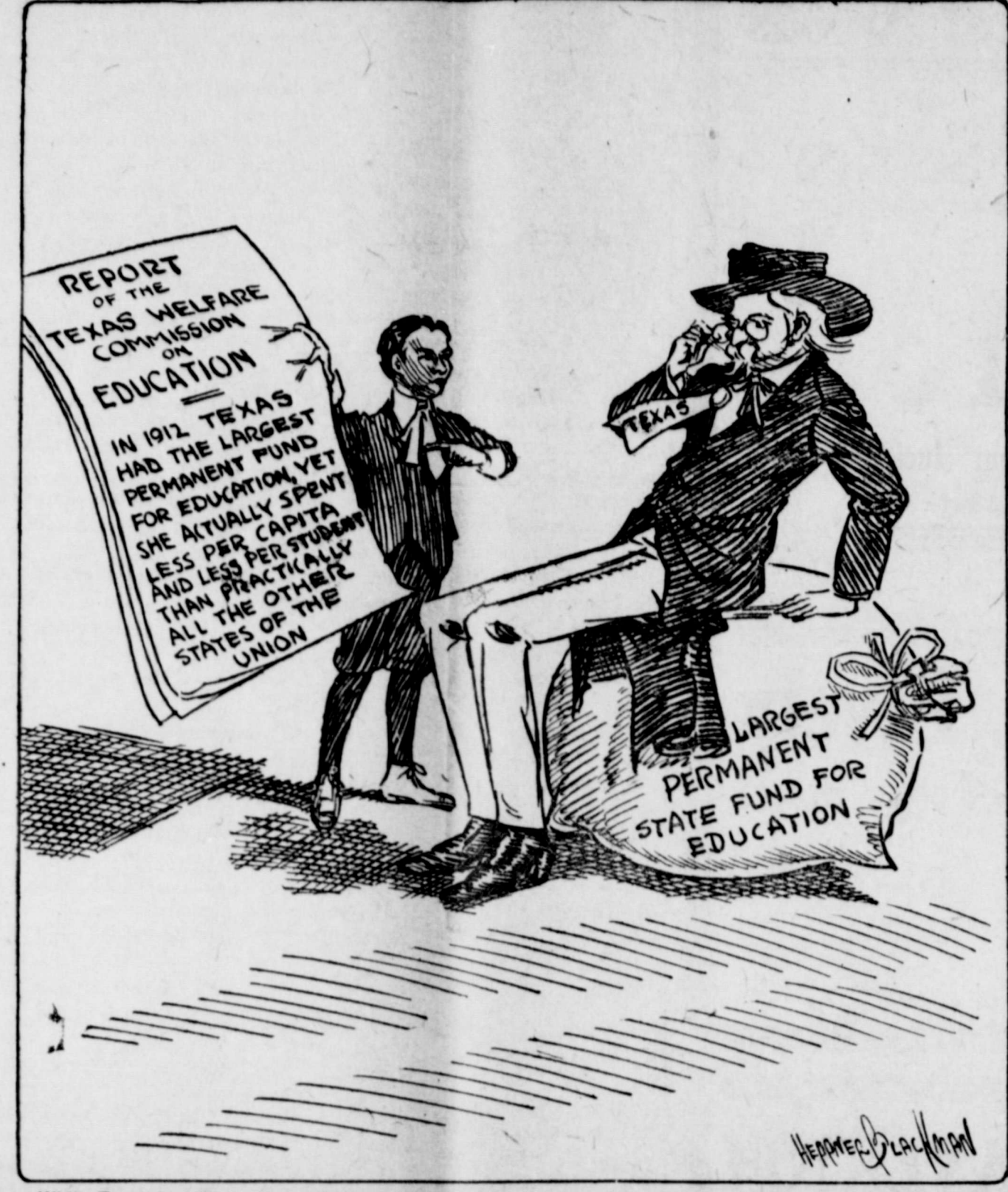
While Texas has the largest permanent fund for education, yet she actually spends less per student than practically all the other states of the Union .- Texas Welfare Commission.

man of the committee appointed to inspect the archives of the capitol, reports tons of valuable records lying on the basement floor. Many of the State documents bearing the signature of General Sam Houston.