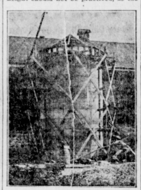
Silo Made of Concrete.

In placing concrete, the most important thing to be observed is the manner of handling. The materials must forms. Pouring from a considerable height should not be practiced, as the