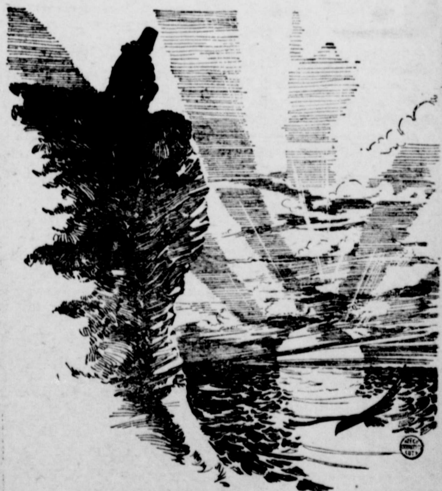
NAPOLEON A PRISONER AT ST. HELENA

NAPOLEON lost the battle of Waterloo because a division of his army was behind time and he died a prisoner at St. Helena, and France lost her place in civilization. The pages of history are replete with stories of nations that have withered and decayed because their leaders were behind time and the stream of progress is lined with the wrecks of nations that lost their opportunity because their leaders procrastinated. There can be no greater tragedy than that of an over-taken horizon