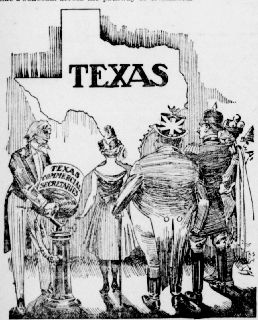
UNCLE SAM TALKING TEXAS

Prosperity always comes to countries that advertise. The Commercial Clubs of Texas are getting out literature that is shaking the continent and charging the atmosphere with progress, and the Commercial Secretaries are throwing the resources of Texas like a sunbeam across the pathway of civilization.