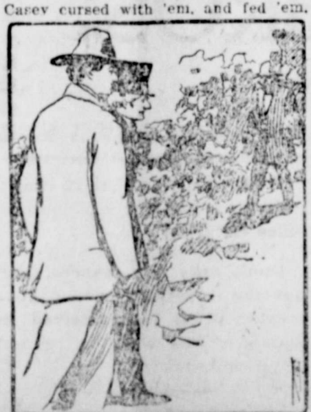
"Here Comes the Man Who is to Kill You!"

"Casey!" almost shouted Captain Plum. "What the devil do you mean?" "Ho, ho, ho-haven't you guessed the truth yet, Nat? While you and I were getting acquainted last night a couple of fishermen from the mainland dropped alongside your sloop. They had been robbed by the Mormon pirates. They cursed Strang. They swore vengeance. And your cautious