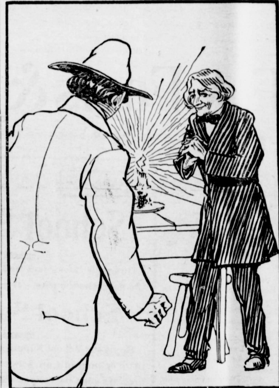
"I Know More Than That, Nat."

"Young man, will you shake hands with me? Will you shake hands?—and then we will go to St. James!"