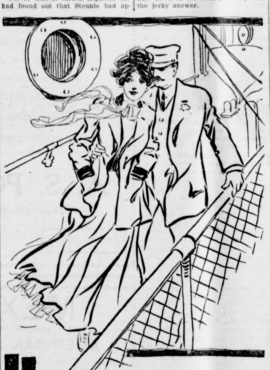
"Eunice Means 'Happy Victory,' You Know."

"Well, sir, as far as I can make out he's all gone to pieces-pegged For by dint of careful inquiries she out-down on his luck, y' know," was