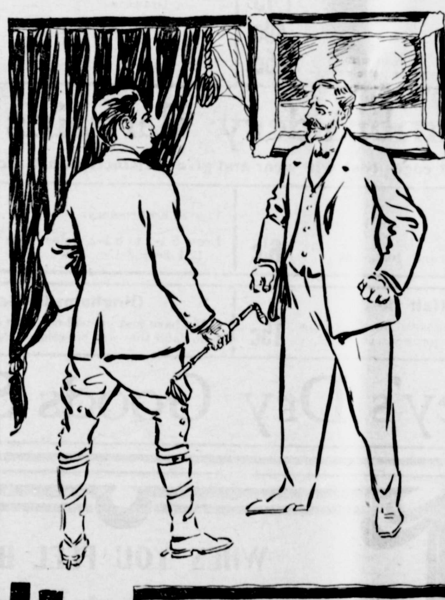
"I Am Not to Be Frightened or Blackmailed, Mr. Hews."

Read the little book, "The Road to Wellville," in pkgs. "There's a Reason."