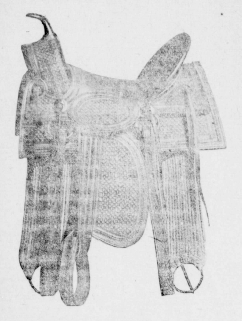
BOYS' SADDLE CUT

Premiums to be given away to boys and girls for Cash Register Checks. This makes the largest and most valable list of presents we have ever given away and as they are absolutely free for Cash Register Checks they are worthy of your inspection and can be seen in the show windows at our Furniture Store, and you are invited to call and see them. They are as follows: