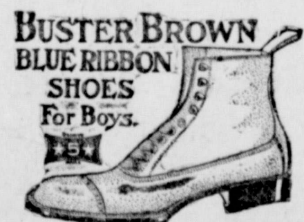
BUSTER BROWN SHOE CUT.

We will give three Single Barrel 16-guage Shot Guns to the three Boys who get us up the fourth, fifth and sixth largest amount of Cash Register Checks.