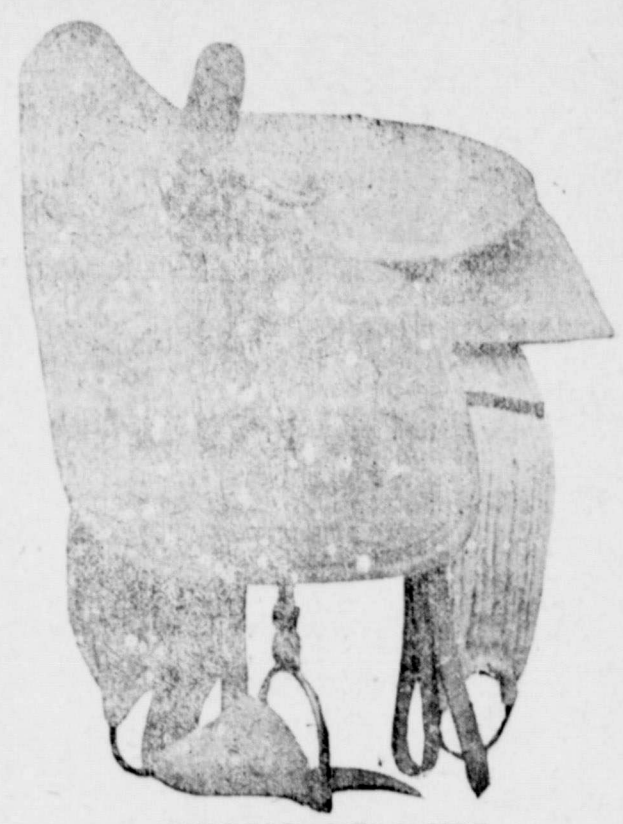
GIRLS' SADDLE CUT. This saddle will be given to the girl who gets us up the largest amount of Cash Register Checks.

Do Not Fail to Get Checks-They will be given to all customers at both stores and in all departments (except to dealers on wholesale bills.)