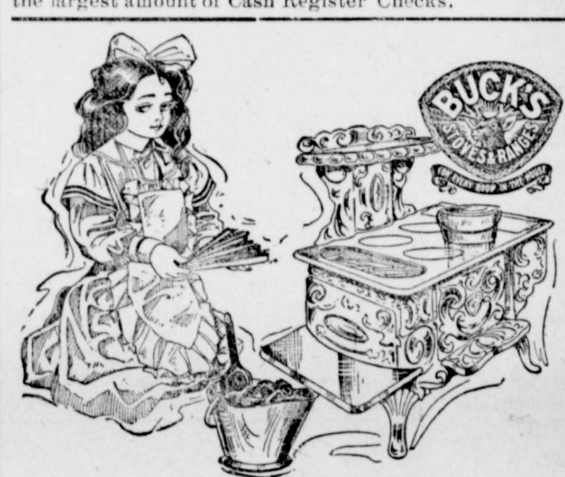
GIRLS' STOVE CUT. We will give two of these Buck's Jr. Ranges to the two girls who get us up the second largest amount of Cash Register Checks.