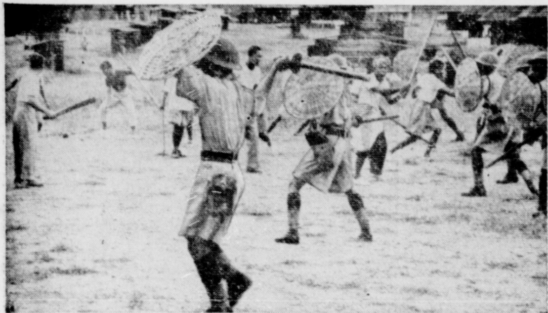
IT'S A FAKE—A free-for-all appears in progress, but it's only a sham battle in Singapore. The riot squad of the police force was staging a demonstration of riot-breaking tactics for Sir John Martin, Permanent Under-Secretary of State for the British Colonies.