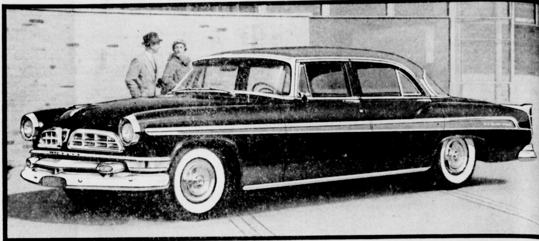
1955 CHRYSLER NEW YORKER DELUXE 4-DOOR SEDAN

"Old at 40, 50, 60—Man, You're Old" Forget your age! Thousands are peering through the "peering up" with new, higher Oxtrex Tonic Tablets. For weeks, feeling due solely to body's lack of which many men and women call Oxtrex for pep, vigor, younger feeling. "Get-acquainted" size 50¢. At all