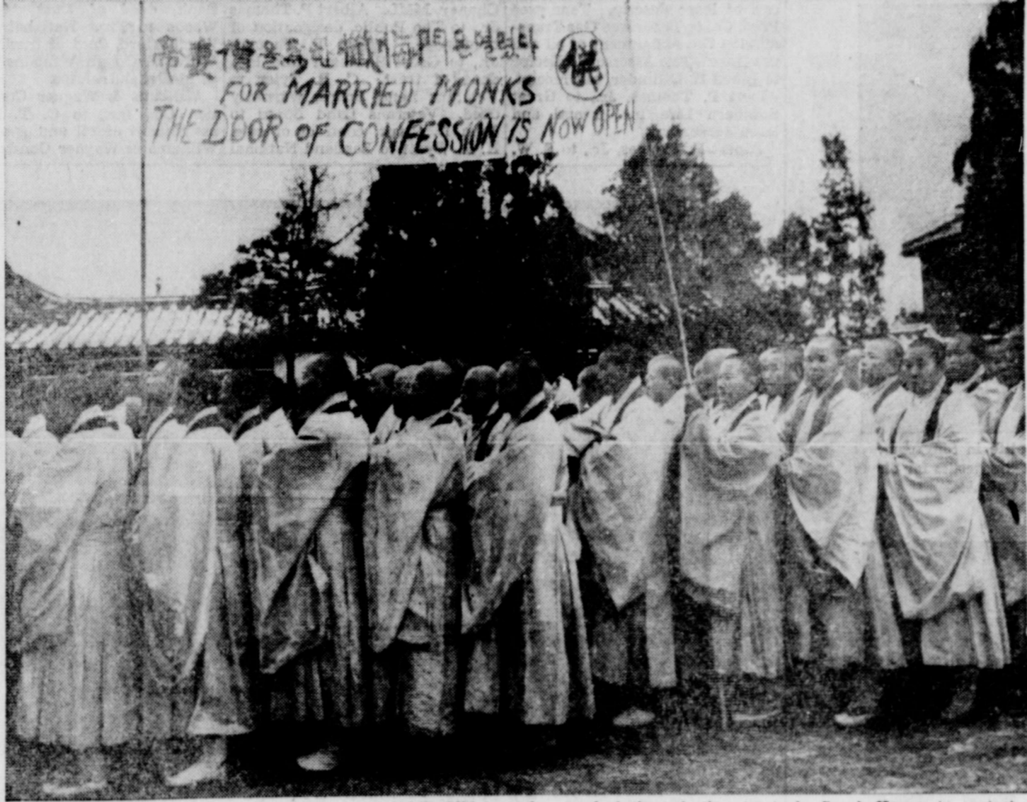
TROUBLE IN PARADISE —Part of 500 unmarried Buddhist monks marched through the streets in Seoul, Korea, to protest against the married monks in the temples. The bachelors want their married associates to give up either the temples or their wives and start their religious lives anew. These determined demonstrators had a short clash with the police.