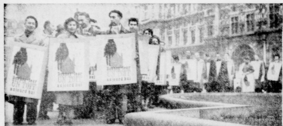
PICKET APPEAL—Picarded Parisians gathered in front of the city hall before marching through the French capital in a campaign to obtain housing for the slum-dwelling flock of the Abbe Pierre. The signs, carried by men and women demonstrators, ask for a roof today.