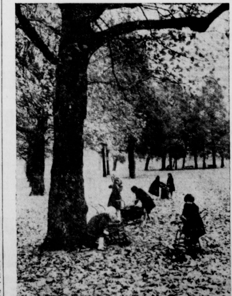
AUTUMN IN ENGLAND—Little girls are scampering like squirrels through the leaves of Green Park in London, and loading their strollers with firewood. The chill autumn winds had carpeted the park with colored leaves from the rows of trees, and the youngsters were having the time of their lives.