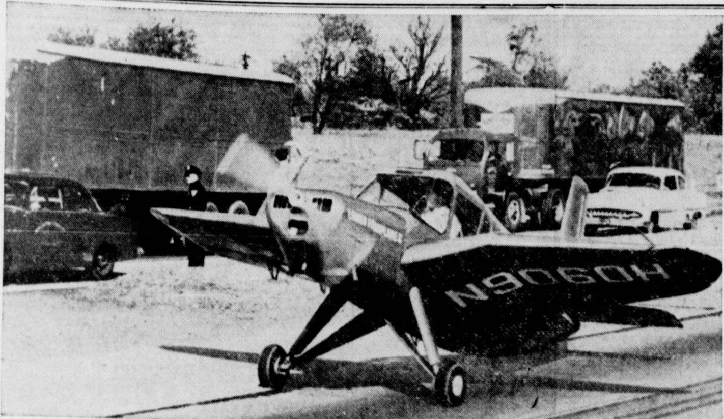
TAKING TO THE ROAD —The new Lanier Paraplane, which has an air speed of 180 m.p.h. and can land and take off in a limited space, taxis along a highway at Burlington, N. J., to a nearby plant where a prototype of the plane will be constructed. The plane is 22 feet long and has a wing span of 20 feet. It gets its name from parachute features in the wings.