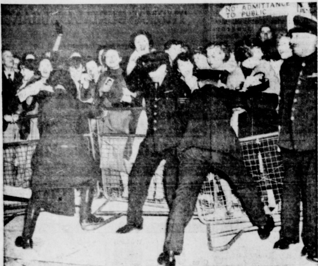
WILD ENTHUSIASM —Singer Frankie Laine got a tremendous reception at the London airport when he arrived for a tour of England. So enthusiastic were his teen age fans that local police had to go into restraining action to keep the kids from tearing Frankie to pieces.