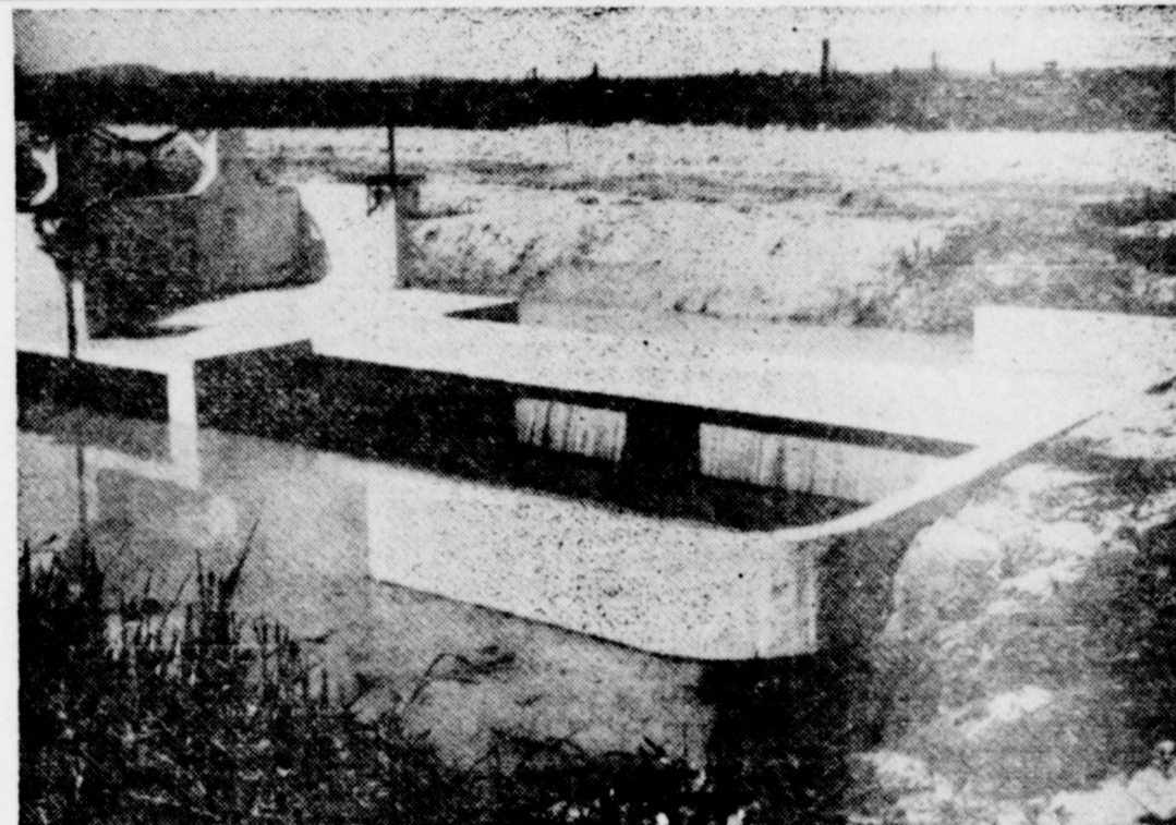
CULTIVATING THE LAND—This control lock is part of an extensive irrigation system being constructed by the Perak State Government of Malaya in Changkat Jong area. A five-year plan in progress is expected to turn 6000 acres of wasteland into rice paddies for Chinese colonists who have agreed to keep the land under cultivation.