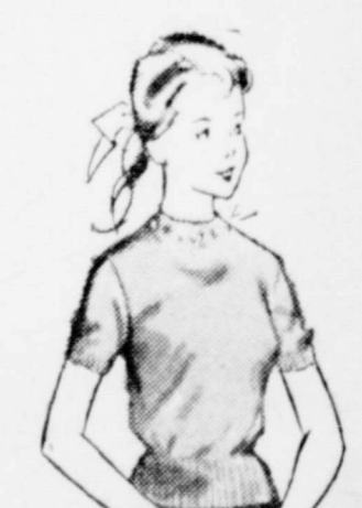
PURE ORLON SLIPOVERS . . . WITH GLITTER!

Choose from sweet sherbet tints of pink and blue, choose in sizes 2-14, choose this wonderful buy in briefs for back to school. Elastic legs. Stock up now for many refreshing changes all Fall at this low "Back-to-School" price.