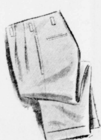
RAYON-NYLON GABARDINE! BOYS' SLACKS 4.98

boys' sizes 2-18 News in the colors — pink, charcoal, blue or maize! News in the outstanding fabric — Dan River's fine combed cotton chambray (it's machine washable, shrink-resistant)! Top styling, too — rounded collar, 2 button-through pockets, long sleeves. Another terrific Penney value!