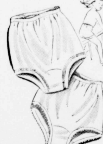
RAYON AND COTTON BRIEFS FOR GIRLS

T-Shirts 59c Briefs 49c Stock up now, for the hot summer months and for back-to-school! Fine quality combed cotton throughout with better-wearing nylon-reinforced knit collarette on the T-shirt. Styled for active boys.