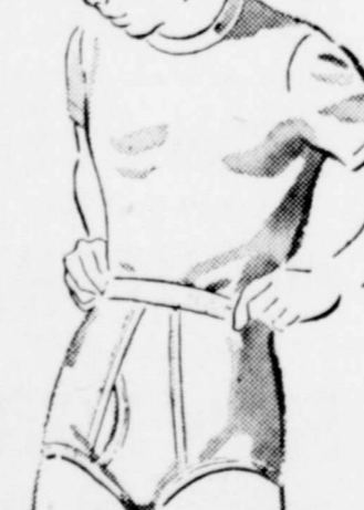
BOYS' QUALITY COMBED COTTON UNDERWEAR

Extra heavy sheen gabardine—85% rayon with 15% nylon added for toughness, longer wear — top quality at a Penney-low price! They're a neat dressy look, are practical for school or play because they're machine washable. Continuous waistband, pleated front, zipper fly, matching belt; 10-20. Jr. boys' sizes 2-10 — 3.98.