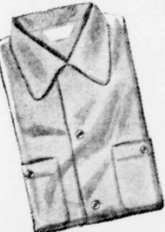
WRINKL-SHED CHAMBRAY SPORT SHIRTS 1.98

boys' sizes 2-18 News in the colors — pink, charcoal, blue or maize! News in the outstanding fabric — Dan River's fine combed cotton chambray (it's machine washable, shrink-resistant)! Top styling, too — rounded collar, 2 button-through pockets, long sleeves. Another terrific Penney value!