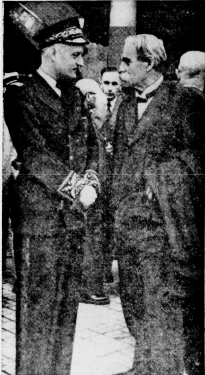
GUEST OF HONOR —Dr. Albert Schweitzer, right, philosopher, organist, writer and missionary, chats with a uniformed prefect at a ceremony in Colmar, France, commemorating Frederic A. Bartholdi, sculptor of the Statue of Liberty. Dr. Schweitzer, winner of the 1952 Nobel Peace Prize, was the honored guest at the ceremony.

New Bridge Texas Governor Allan Shivers will be the chief speaker at August 21 ceremonies opening the $2.5 million surfside highway bridge at Brazosport. The bridge is the only fixed span over the Intracoastal Waterway. It has a 78-foot vertical and 201-foot horizontal clearance for water traffic. Road Bids Bids for construction on 288 miles of state roads were scheduled to be opened by the State Highway Department Tuesday and Wednesday with estimations running around $9 million. Bids were to cover some 182 miles of farm roads and 106 miles of state and federal highways. A large portion of the total cost will go for expressway construction in Austin and Dallas. Farm Income Up Texas' farmers earned more during January-June of this year than during a like period last year although farm prices were declining, the University of Texas-Bureau of Business Research has reported. The bureau said that farm income was running nine per cent over that of the first six months of 1955. Increased revenues from cotton and cattle were primarily responsible for the increase, the bureau said.