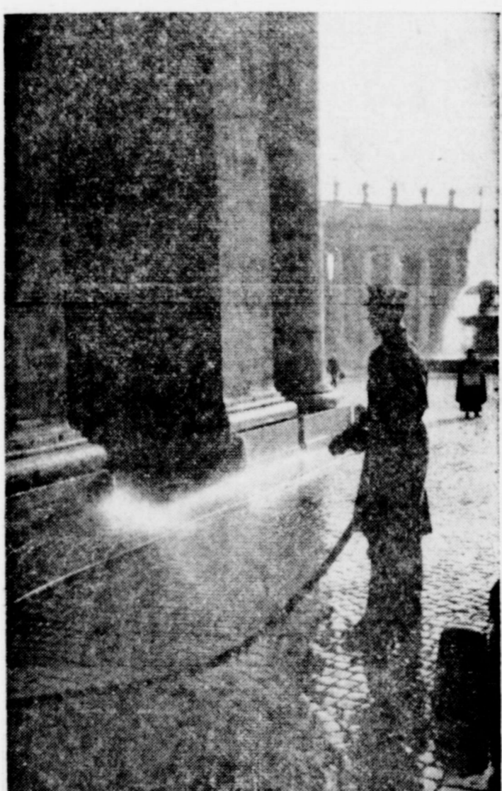
COOLING SPRAY —The smooth brick walkway under the Bernini colonnade in the Vatican City gets a watering down to keep it cool during a hot summer's day. Many such squares in Italy are sprayed to provide cooling comfort for visitors.