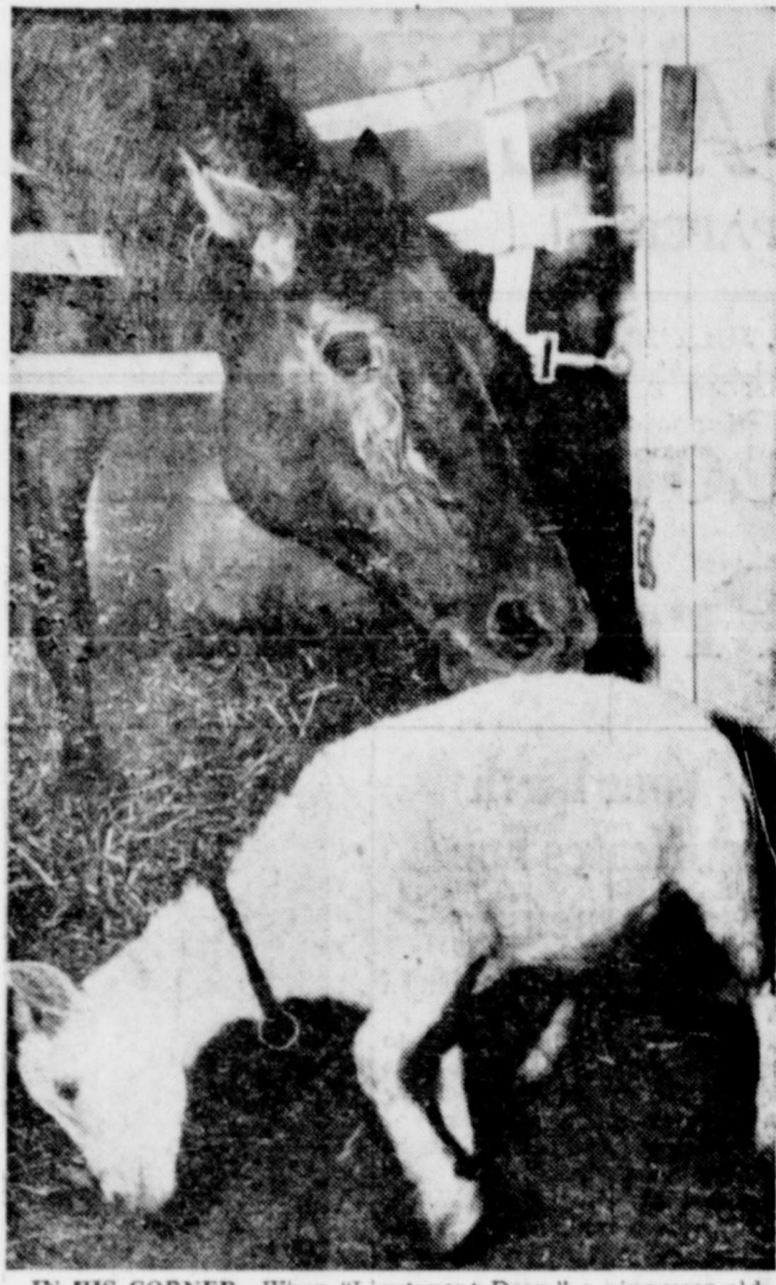
IN HIS CORNER—When "Lieutenant Dean," a nine-year-old trotter, needs a friend in Cleveland, O., he knows he can always rely on "Sandy," a goat known to be devoted to the thoroughbred.