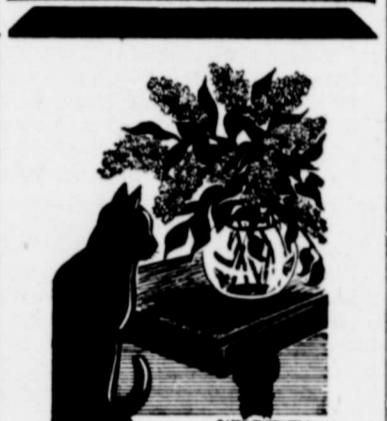
KNOW A SURE CURE FOR "THE BLUES"?