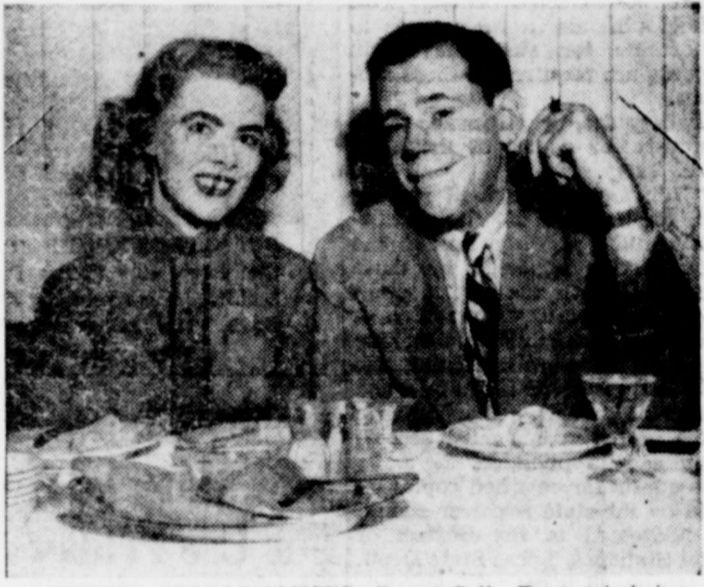
BETWEEN PERFORMANCES—Pretty Sally Forrest is being treated to a dinner by co-star Tom Ewell after a matinee of "The Seven Year Itch," their hit comedy which is now the longest running play in New York.