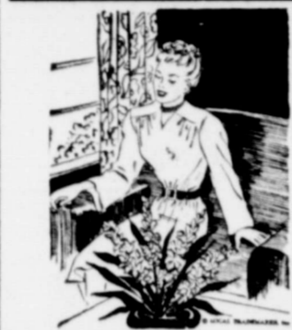
TIME FOR A "NEIGHBORLY" GESTURE?