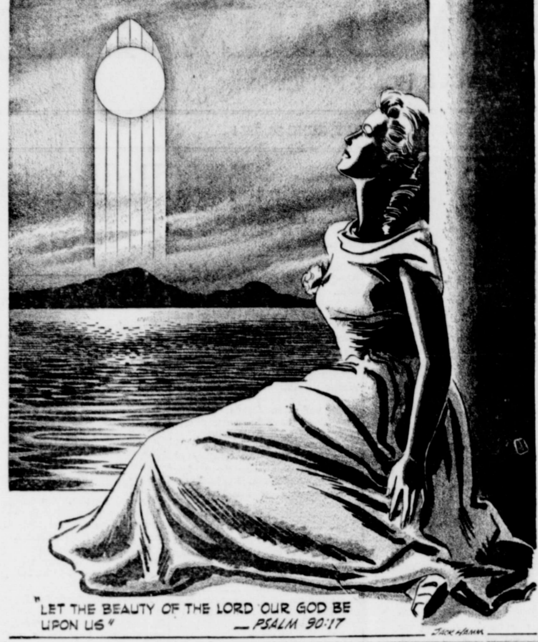
LET THE BEAUTY OF THE LORD OUR GOD BE UPON US — PSALM 90:17