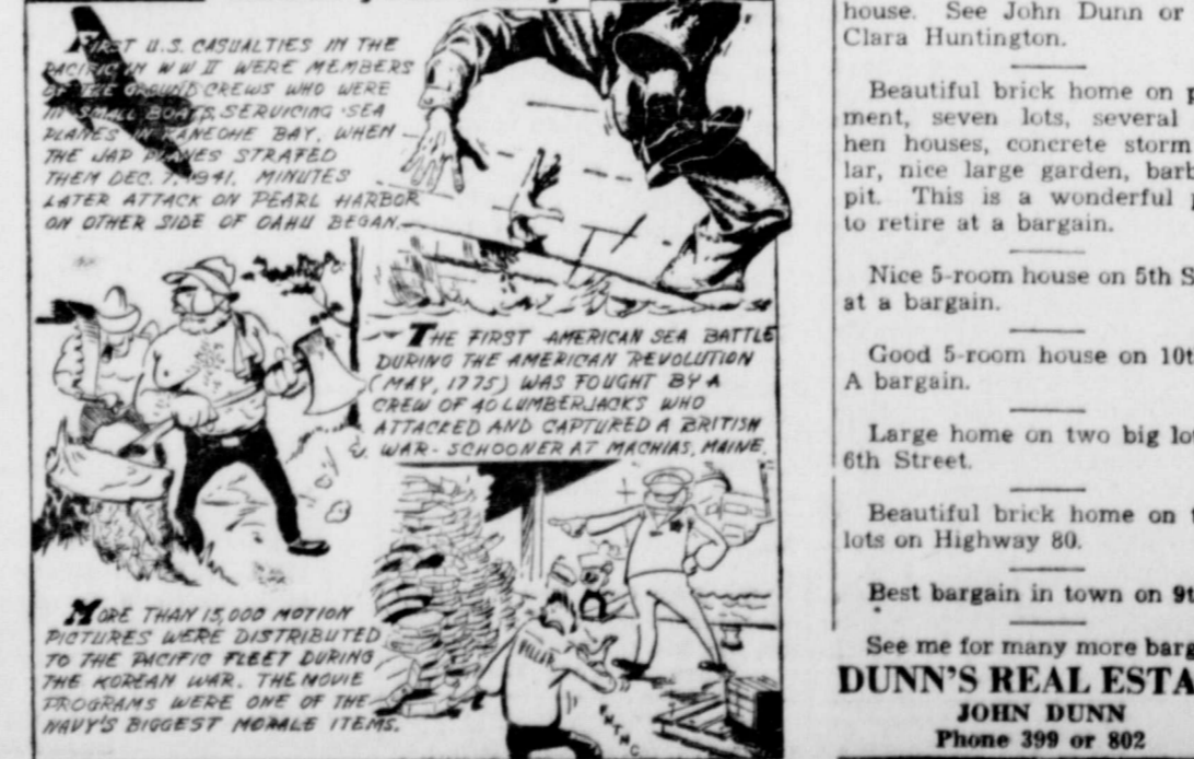
More than 15,000 motion pictures were distributed to the Pacific Fleet during the Korean War. The movie programs were one of the navy's biggest morale items.