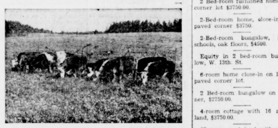
A productive, well fertilized Ladino-fescue pasture such as this is a valuable asset to any farm.

Grassland farming is valuable. But it has little value unless used with judgment. The best procedure will vary from place to place, but it will in general be based on the following considerations: